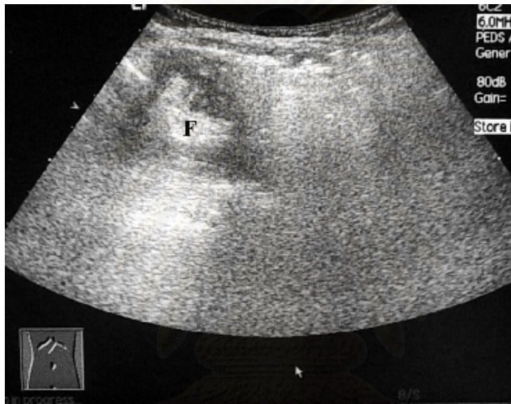
Figure 2. Cross sectional sonography of the mass showed hypoechoic mass with crescentic hyperechoic representing mesenteric fat inside (F). These findings are also characteristic for the intussusception.

non-surgical treatment. Pneumatic or air enema under ultrasound guidance was selected as the method for non-surgical reduction. The procedure was performed with pediatric surgeons stand by. Before starting the reduction, the infant was sedated with chloral hydrate for relaxation. Simple device for pneumatic reduction was used (Figure 3).