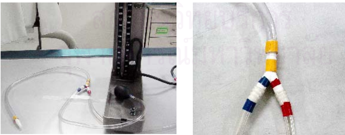
Figure 3. Figure on the left is device used for pneumatic reduction. Bulb syringe and manometer are connected proximal to Y-shaped connector. (right figure)