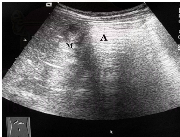
Figure 4. Image performed during pneumatic reduction showed backward movement of the intussusceptum (M) with increased air echo in the colon. (A)

perforation or tension pneumoperitoneum. The applied air pressure in this case was only about 70 mm Hg. There was rapid reduction with backward movement of the intussusception and increased air echo in the colon. The characteristic ultrasound of intussusception disappeared within about 10 seconds after starting the air pump. There was diffuse air echo in the small bowel and loss of the palpable mass (Figure 4). The infant immediately stopped crying and burp. A plain radiograph of abdomen was finally performed to confirm complete reduction. The radiograph showed generalized air-filled bowel and disappearance of the mass (Figure 5). The infant was observed for 24 hours before discharge. There was clinical improvement without complication or recurrent of disease.