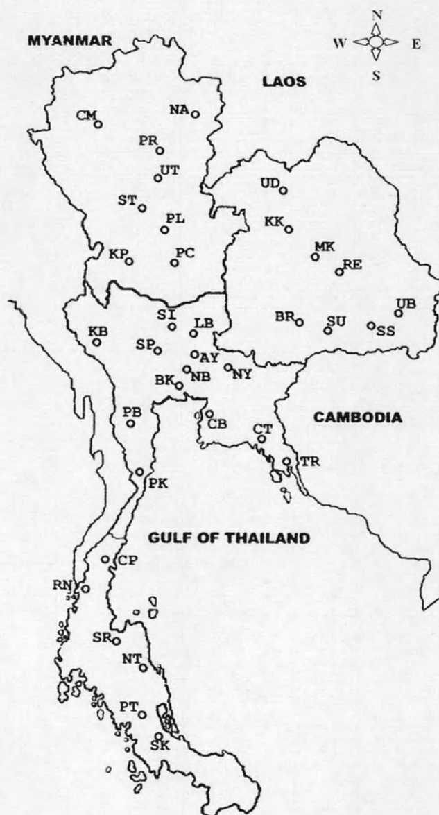
Figure 3.1 Collection sites of T. pagdeni Schwarz in Thailand. See Table 3.1 for locality names and sample sizes.